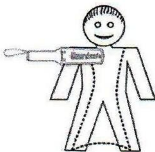
Front scanning(figure 3)